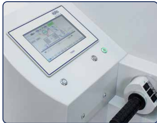
Touch panel with graphical interface for easy and clear operation.

The Kuris A55 spreading machine is ideally suited for critical, smooth materials or even poorly wound rolls of material, with a wide range of different surfaces. The new deviating roller system of the driven cradle or material bar ensures an excellent quality in spreading. Excellent spreading results are achieved even with fully automatic spreading of tension-sensitive materials. The precisely regulated material specification can be adapted precisely to the required spreading speed. The semi/fully automatic unthreading/threading of the fabric considerably reduces the set-up times. Many spreading steps with different positioning and cutting points, numbers of fabric layers, zig-zag spreading programmes as well as numerous other material-specific parameters can be programmed individually.